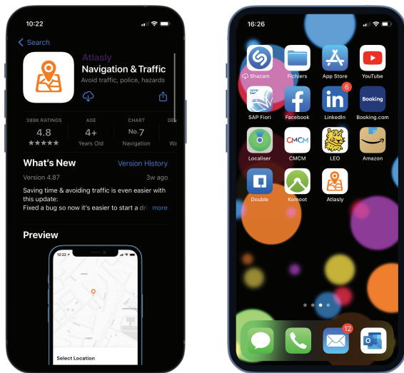
Figure 1: Mock-up of app store and home screen.

We selected suitable permission requests for this study based on the results of Bongard-Blanchy et al.’s [11] study. There, the navigation app and its permissions received strong (un)certainly scores across the different permission types. Thus, as a use case, we selected a fictive navigation app (“Atlasly”) and three app permission requests with differing certainty levels based on Bongard-Blanchy et al.’s [11] study (see Section 2.2), namely: camera (low-medium